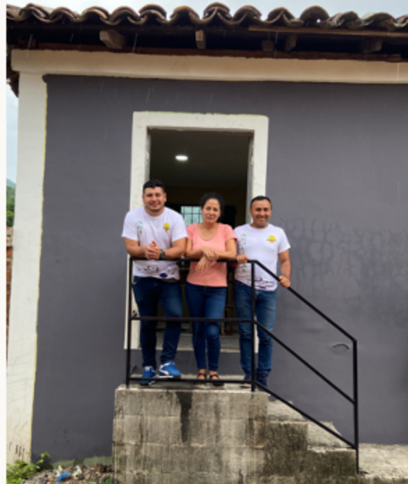
Youth workers outside their new office

Every year, the Arcatao Community Board of Directors prioritizes the projects that need attention in the community and requests our help buying materials for one of them. Last year, we helped buy materials to build an office for the youth workers. The year before, we bought the materials to put a new roof on the childcare center.