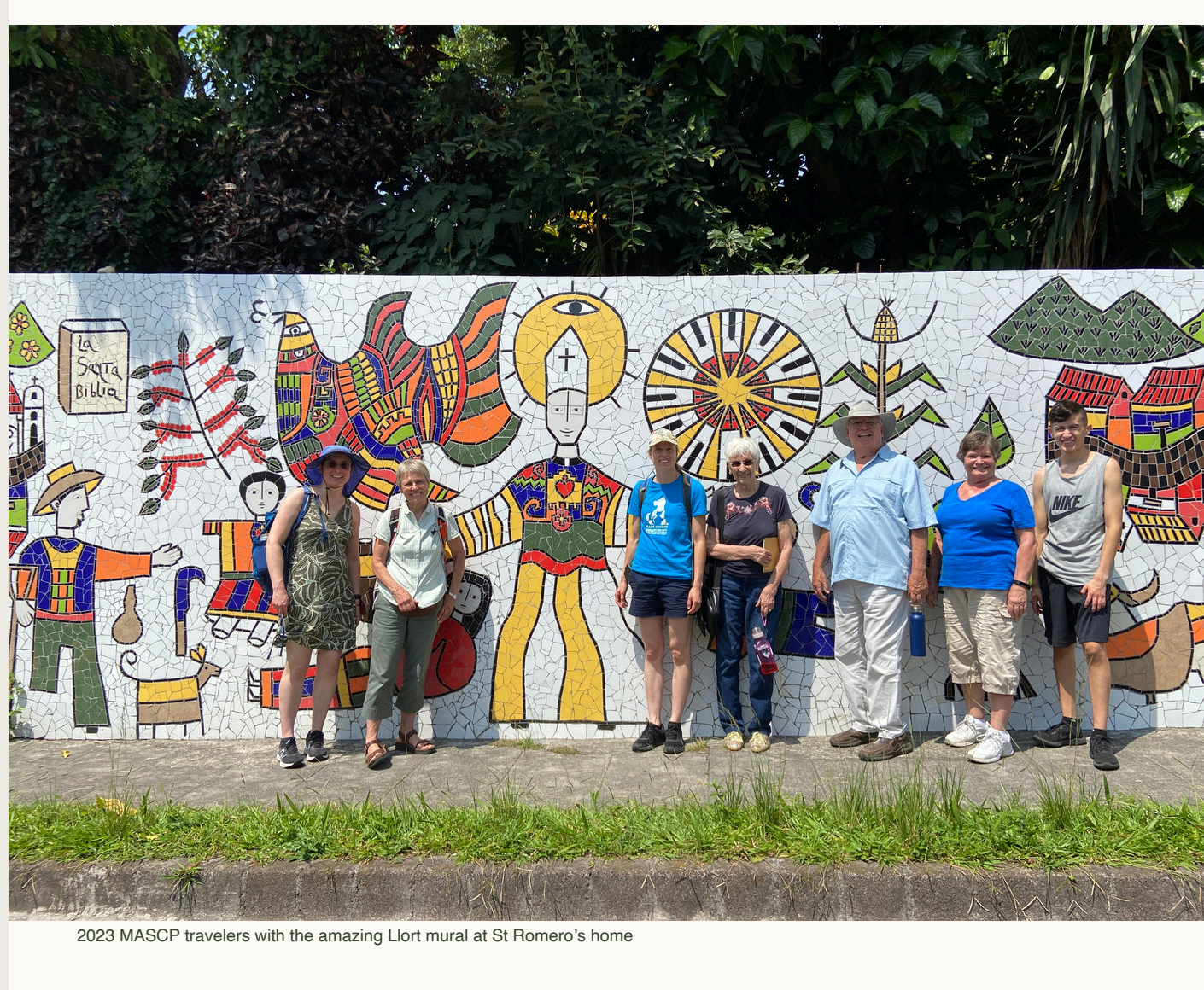
2023 MASCP travelers with the amazing Llorot mural at St Romero's home