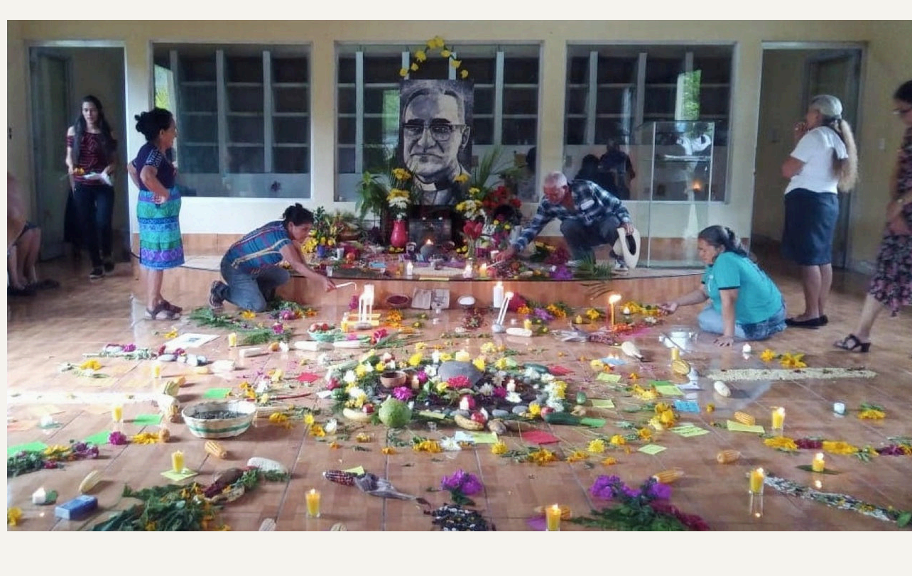
Memorial Healing Ritual in Arcatao, sponsored by the UW-Arcatao Mental Health Project, November, 2019.

This holiday season, a generous member of our community has offered to MATCH ALL donations to MASCP up to $5,000. If you give $100, we get $200! As you can imagine, this is a huge boost to our ability to support our friends in El Salvador.