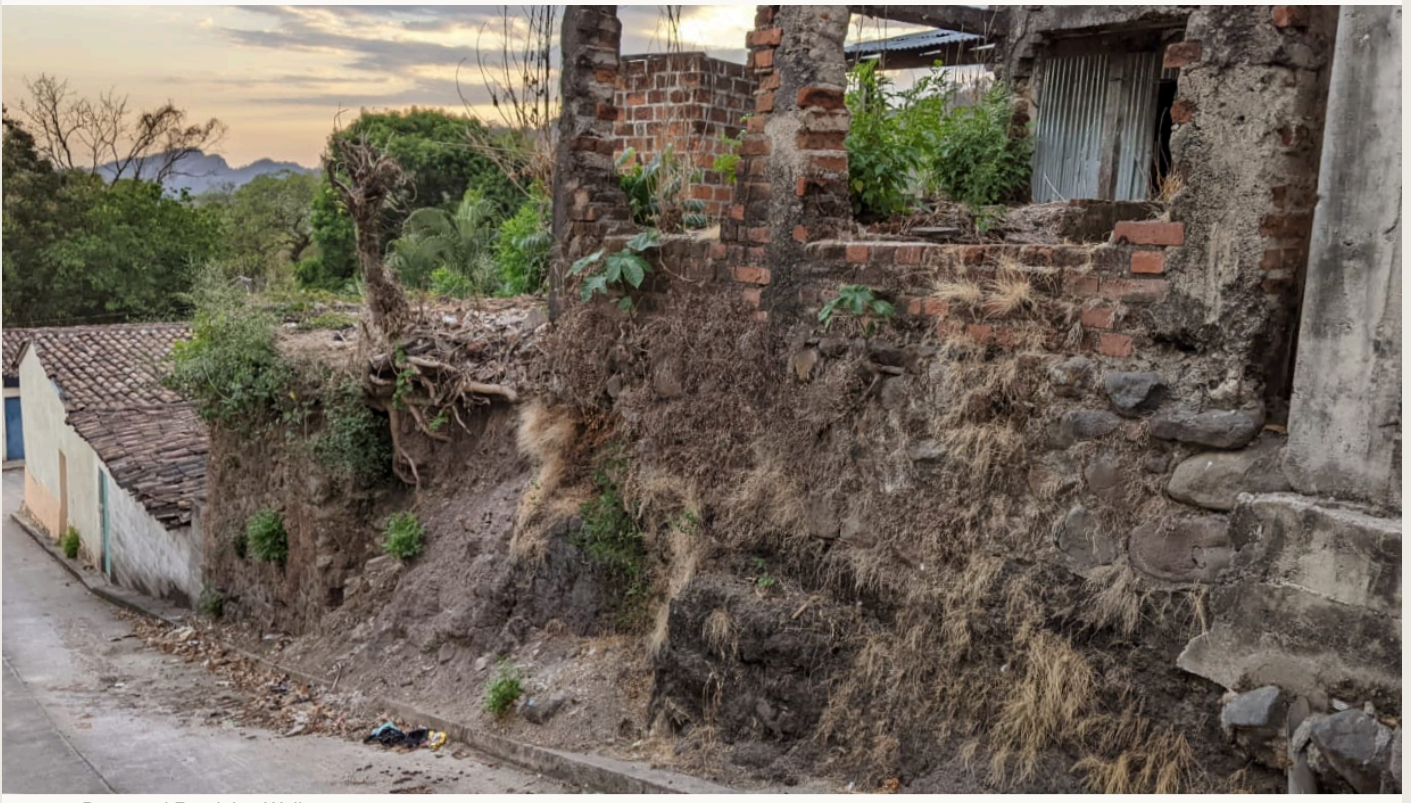
Damaged Retaining Wall