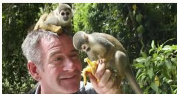
Nigel Marven in the movie, "Wild El Salvador"

MASCP will be collaborating with the Catholic Multicultural Center to show the 2023 film, "Wild El Salvador: In the Shadow of the Volcanoes". In the hour-long movie, British adventurer and naturalist, Nigel Marven, guides us up volcanoes, into crater lakes and introduces us to the flora and fauna of El Salvador.