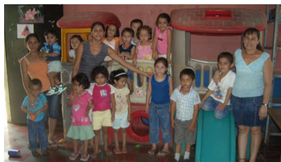
Pre-Covid class at Centro de Bienestar Infantil

The Centro de Bienestar Infantil, Arcatao's community early childhood center, is in need of important repair very soon. The community town council, the Directiva, has identified it as their most critical need right now. There is a danger that the old wood holding up the roof will fall in and the windows, bathrooms, and fence have not had regular maintenance and they should be repaired as soon as possible for the safety of the children, parents and staff.