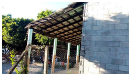
Roof and fencing that need repair

The total cost for all these repairs is estimated at $6,500. Our goal, with your help, is to raise $1,400 which will pay for repairing the roof at this time. There is an effort to collect donations and labor locally for these projects but substantial funds from us would make it go so much faster. Most people in Arcatao do not have steady work. They live on the food they raise themselves, occasional day jobs that pay $1.09/hr and for some, remittances. There is little money to spare so help for large expenses like this is so important. Thank you for all your support both today and in years past. We cannot continue our solidarity without you!