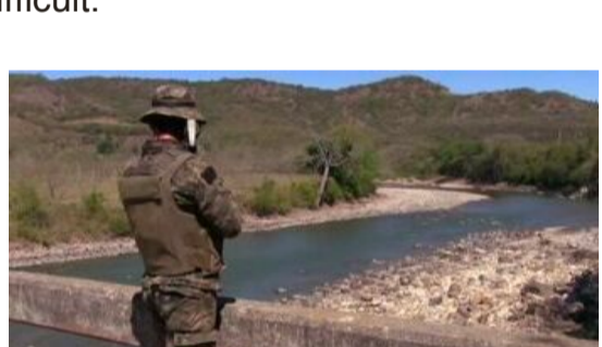
Soldier at the Honduras/ El Salvador border

Under the guise of barricades or "narco-fences" purporting to protect community health, the administration needlessly employs helicopters, weapons, tanks, and military personnel.