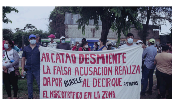
Residents of Arcatao demonstrating against militarization in their community

This is happening in a broader context of re-militarization of society across El Salvador in the name of stopping immigration, gang prevention, anti-crime initiatives and quarantine enforcement.