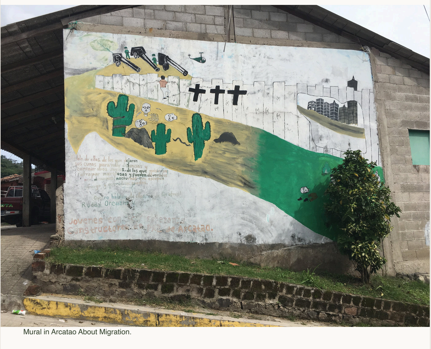
Mural in Arcatao About Migration.