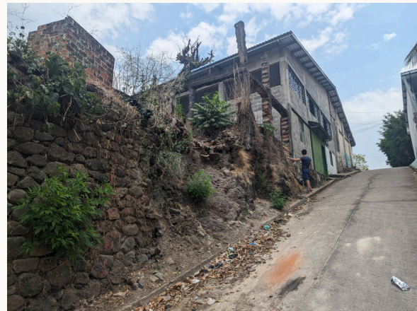
Damaged Retaining Wall